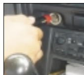
Car lighter adapter to plug in the scale