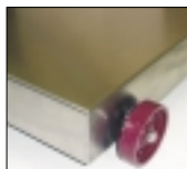
Stainless steel plate