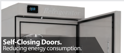
Self-Closing Doors. Reducing energy consumption.