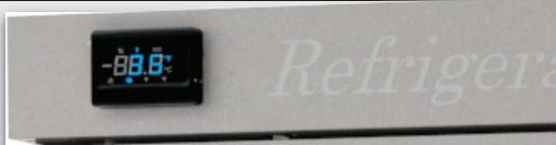
Smart Bluetooth Temperature Control. Optimizes the efficiency of your product.