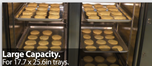
Large Capacity. For 17.7 x 25.6in trays.